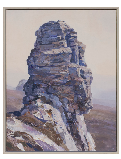
fortitude 2017 acrylic on canvas on board framed in tasmanian oak 47 x 37 cm $2,200