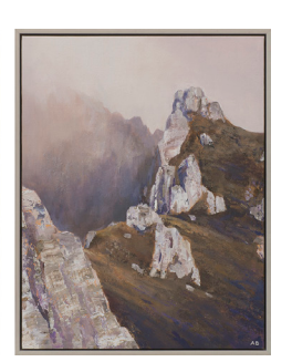
the fortress revealed 2017 acrylic on canvas on board framed in tasmanian oak 47 x 110 cm $4,950