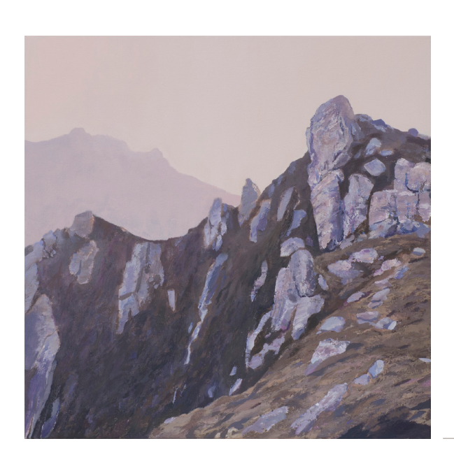
ridgetops and mt. hayes 2017 acrylic on canvas 51 x 51 cm $2,600