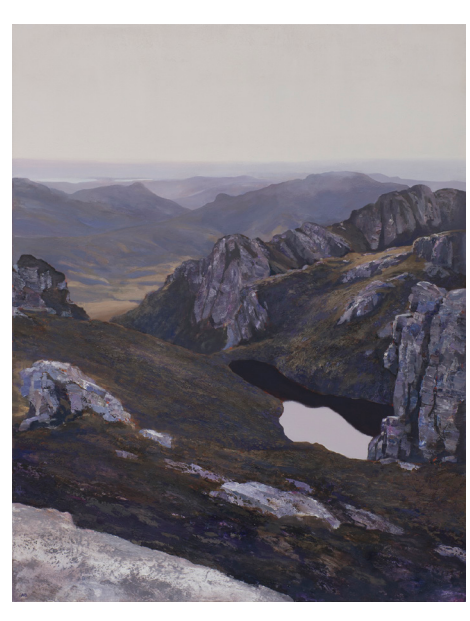
fall away, lake cygnus 2017 acrylic on canvas 137 x 107 cm $7,500