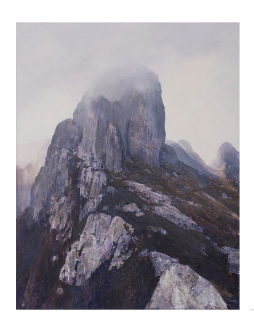
capella rising 2017 acrylic on canvas 137 x 107 cm $7,500