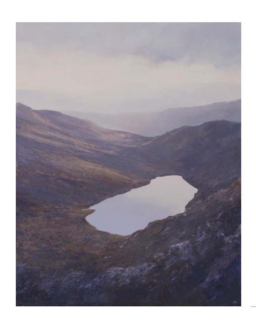
holding the mirror, lake ceres 2017 acrylic on canvas 107 x 84 cm $4,950