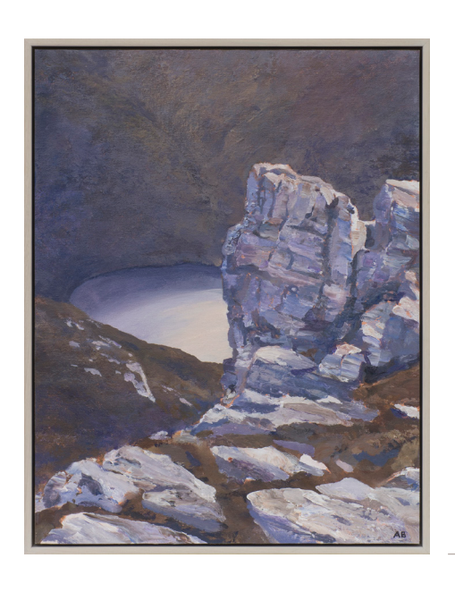
the knoll and lake nereid 2017 acrylic on canvas on board framed in tasmanian oak 47 x 37 cm $2,200