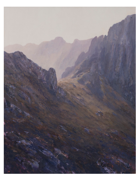
crossing over 2017 acrylic on canvas 107 x 84 cm $4,950