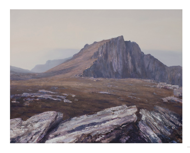
angle of ascent, mt. hesperus 2017 acrylic on canvas 107 x 137 cm $7,500