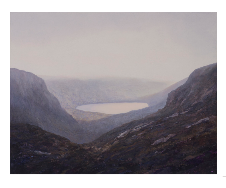
stillness, lake pluto 2017 acrylic on canvas 107 x 137 cm $7,500