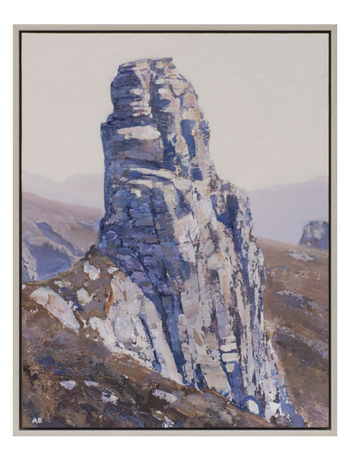
resilience 2017 acrylic on canvas on board framed in tasmanian oak 47 x 37 cm $2,200