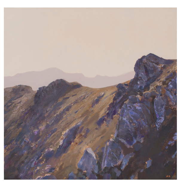
bridging the range 2017 acrylic on canvas 51 x 51 cm $2,600