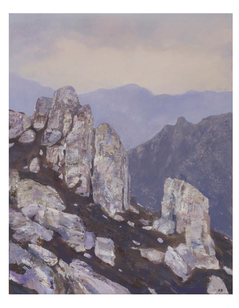
rise and fall 2017 acrylic on canvas 51 x 41 cm $2,200