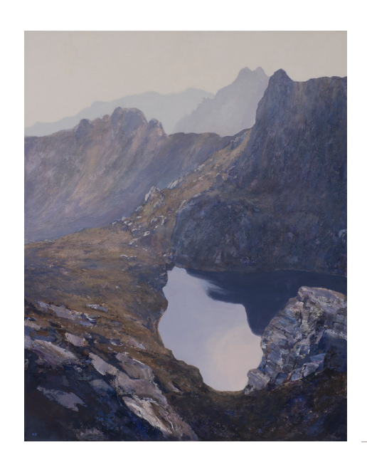
procyon peak, blue shadows 2017 acrylic on canvas 107 x 84 cm $4,950