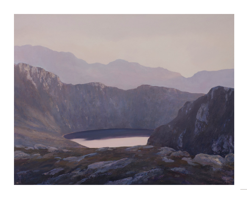
the quiet hour 2017 acrylic on canvas 107 x 137 cm $7,500