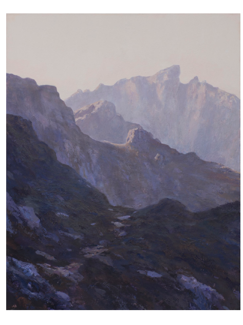
mountain shadows 2017 acrylic on canvas 107 x 84 cm $4,950