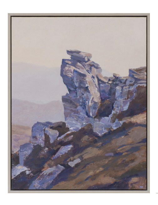
the watcher 2017 acrylic on canvas on board framed in tasmanian oak 47 x 37 cm $2,200