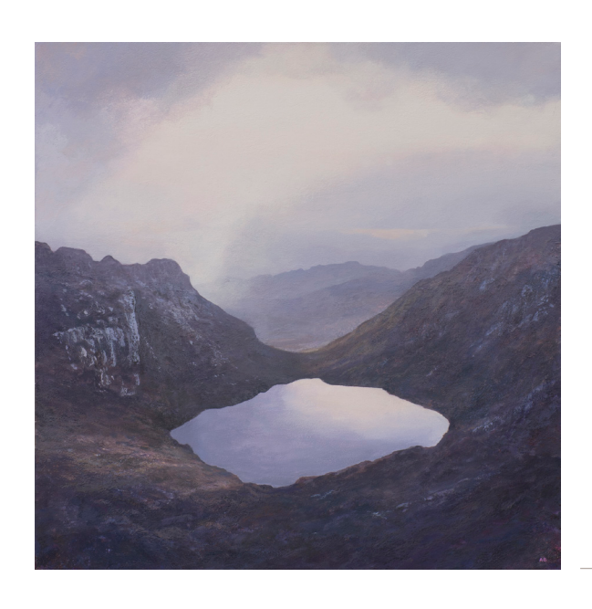
cirque, holding the light 2017 acrylic on canvas 84 x 84 cm $4,500