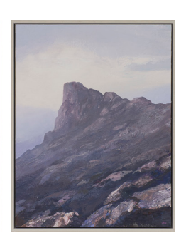
peaks and revelations 2017 acrylic on canvas on board framed in tasmanian oak 47 x 110 cm $4,950