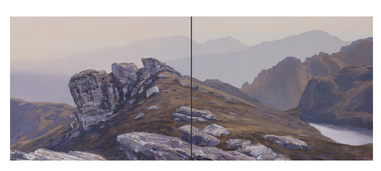
high summer in the arthurs 2017 acrylic on canvas 61 x 152 cm $5,800