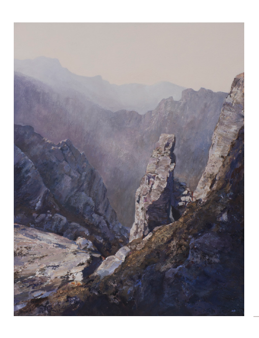
sentry, mt. hayes 2017 acrylic on canvas 107 x 84 cm $4,950