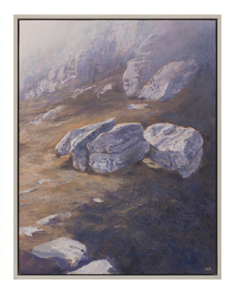
a light filled imminence 2017 acrylic on canvas on board framed in tasmanian oak 47 x 110 cm $4,950