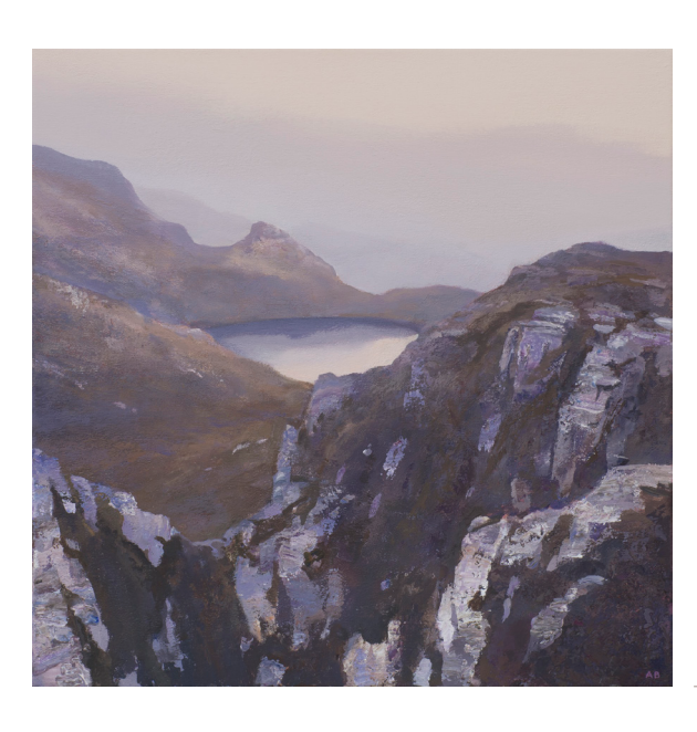
oberon enclosure 2017 acrylic on canvas 51 x 51 cm $2,600