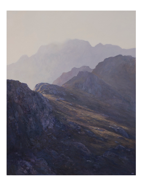
aperture 2017 acrylic on canvas 107 x 84 cm $4,950