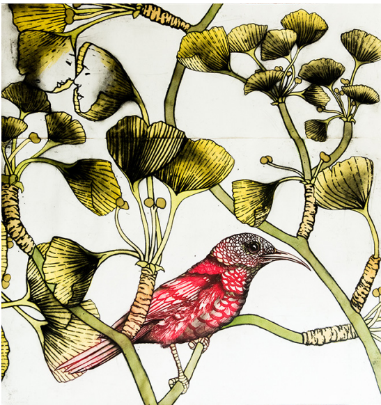
listening for songs 2017 — first exhibited 2011 hand coloured drypoint unique state 131.5 x 124 cm framed $3000