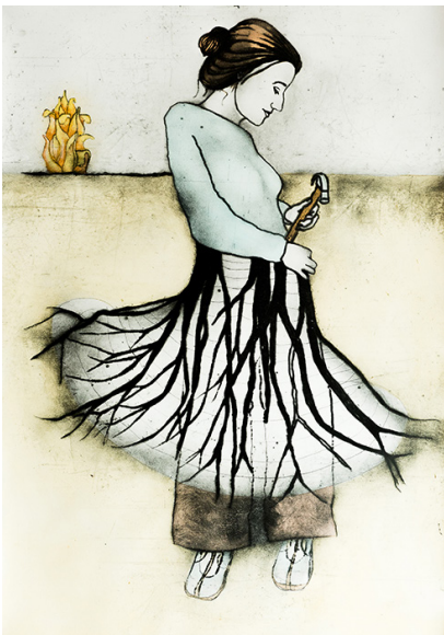
placing roots 2017 — first exhibited 2005 hand coloured drypoint unique state 117 x 87.5 cm $2200