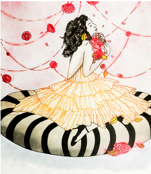
sky orchestra 2017 — first exhibited 2013 hand coloured drypoint unique state 132.5 x 117 cm framed $3300