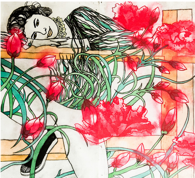
experience and contemplation 2017 — first exhibited 2015 hand coloured drypoint unique state 125.5 x 136 cm framed $3400