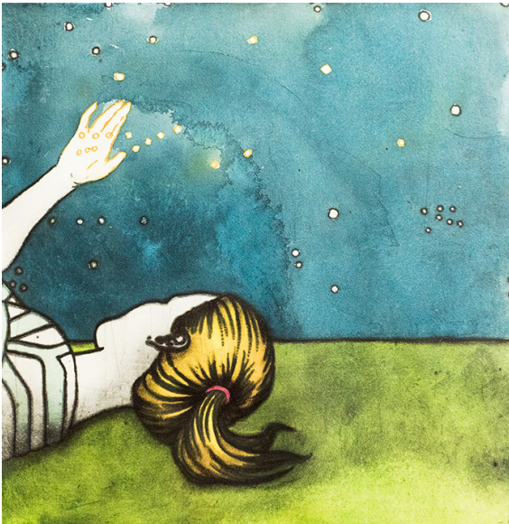
seeing stars 2017 — first exhibited 2015 hand coloured drypoint unique state 61 x 59 cm framed $1300