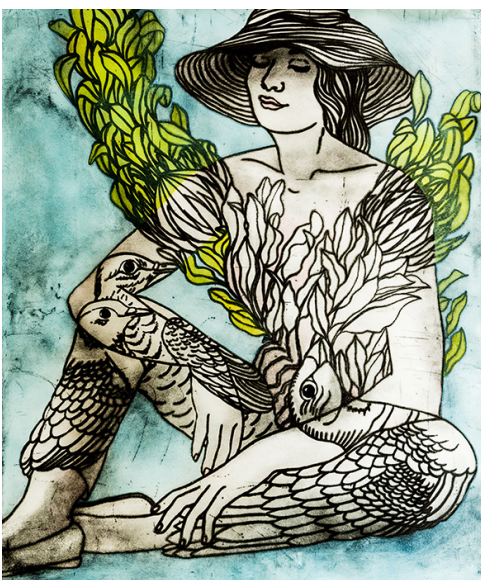
epicurean mind 2017 — first exhibited 2015 hand coloured drypoint unique state 108.5 x 92.5 cm $2900