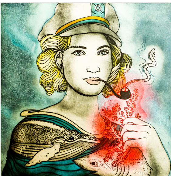
sailor girl 2017 — first exhibited 2016 hand coloured drypoint unique state 74 x 72 cm $1800