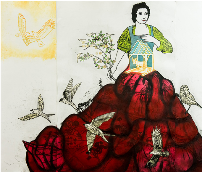
why ask the donkey 2017 — first exhibited 2010 hand coloured drypoint unique state 125 x 144 cm framed $3200