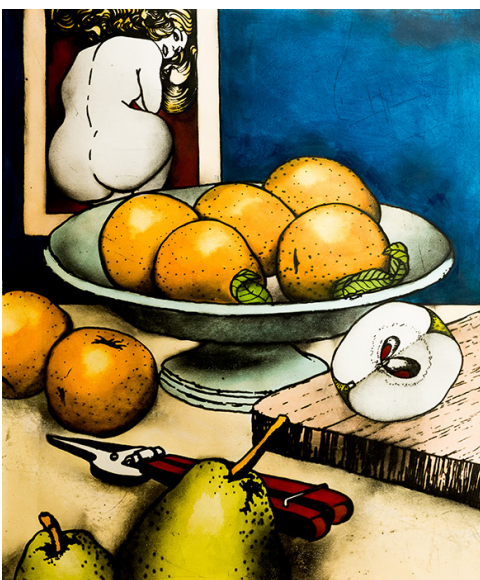
nashi pear 2017 — first exhibited 2014 hand coloured drypoint unique state 108 x 92 cm framed $2900