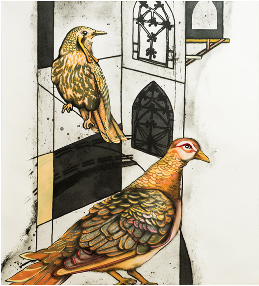
king island 2017 — first exhibited 2007 hand coloured drypoint unique state 98 x 89.5 cm framed $2400