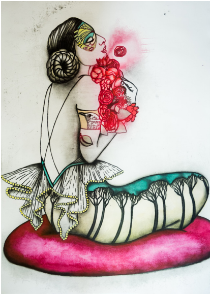
the butterfly ball is a love song 2017 — first exhibited 2013 hand coloured drypoint unique state 125 x 94.5 cm framed $3000